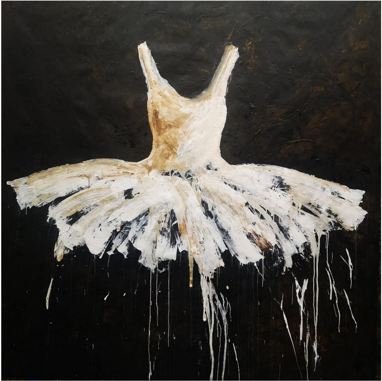
Ewa Bathelier Volcano Dress , 2020 Acrylic on cloth 78.74 x 78.74 in. Hand signed by artist $15,000