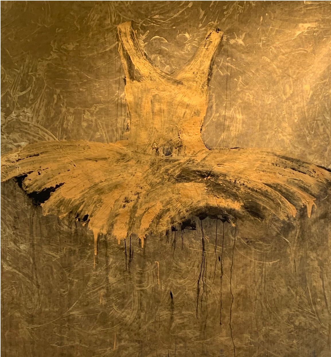
Ewa Bathelier Gold on Gold , 2020 Acrylic on cloth 78.74 x 78.74 in. $15,000