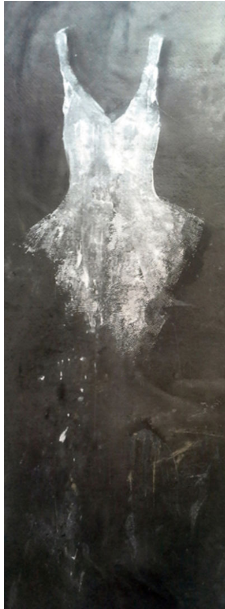
Ewa Bathelier White Toscana Dress, 2014 Acrylic on fabric 96.4 x 31.5 in. Hand signed by artist $9,000