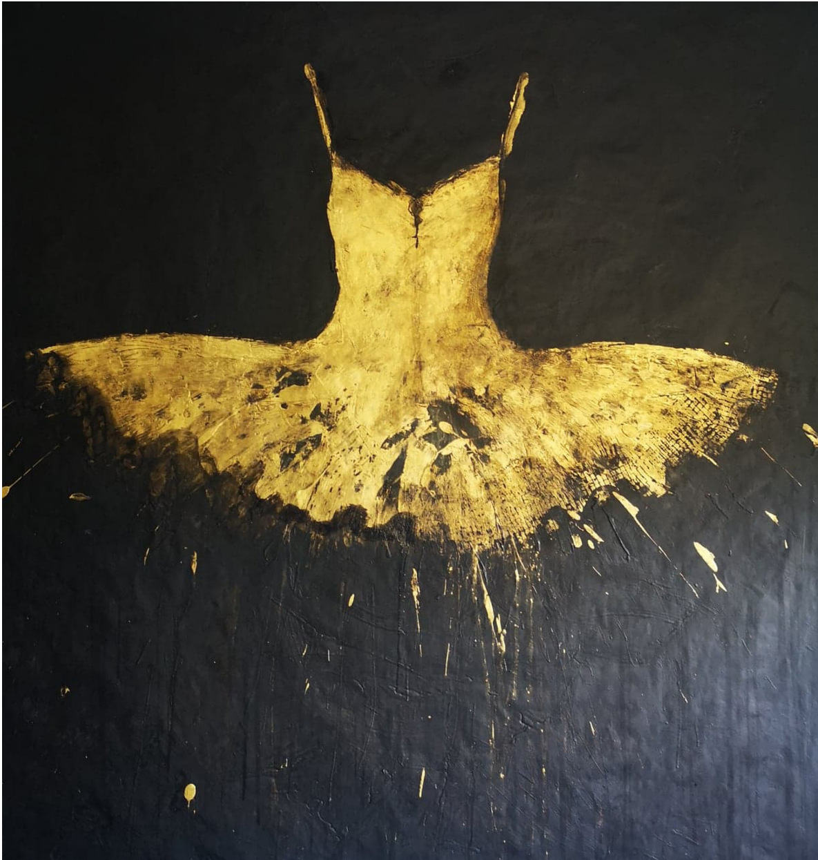
Ewa Bathelier Golden Dress , 2020 Acrylic on cloth 78.74 x 74 in. Hand signed by artist $15,000