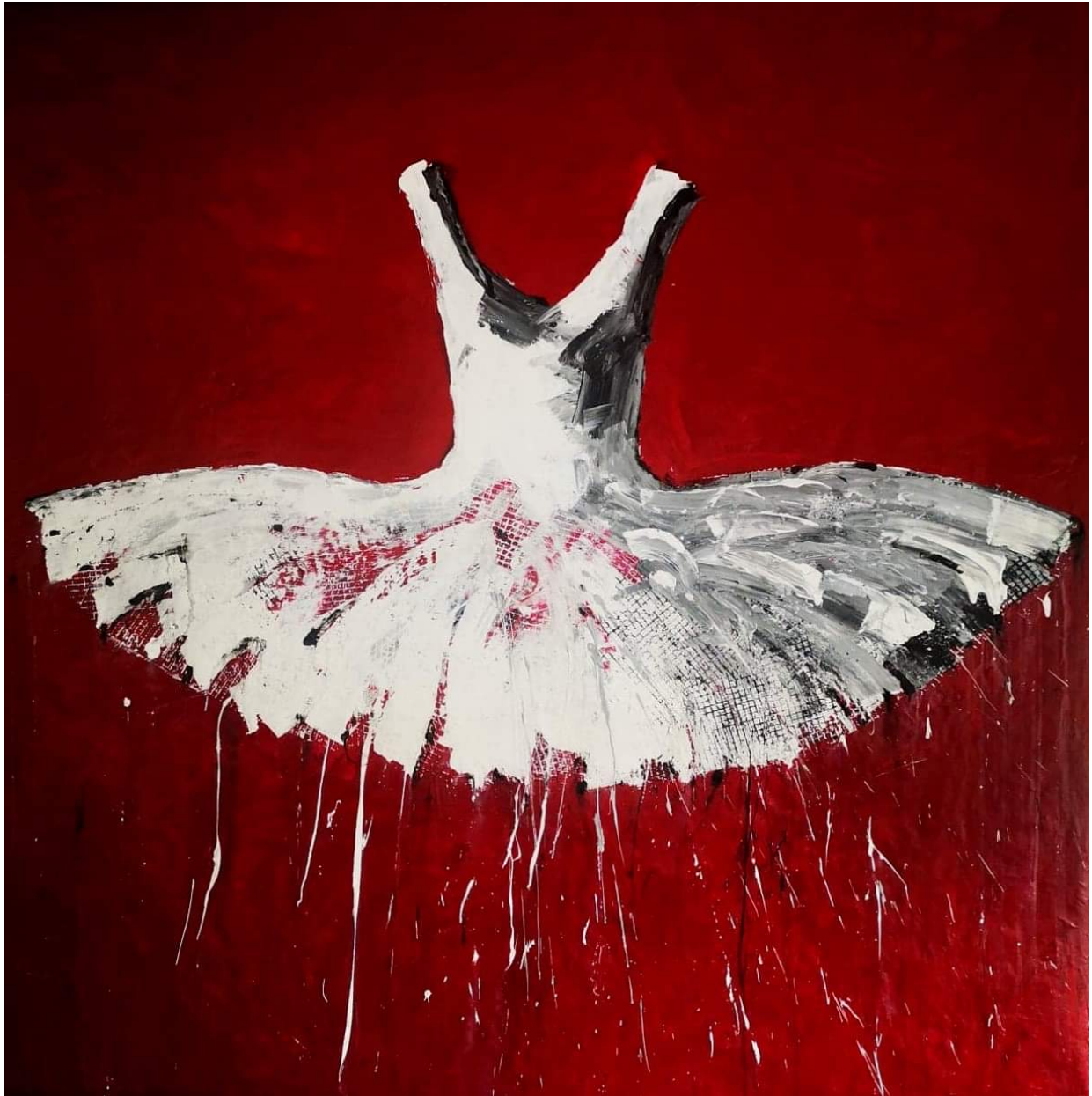
Ewa Bathelier Deep Red, 2020 Acrylic on cloth 78 7/10 x 78 7/10 in. Hand signed by artist $15,000