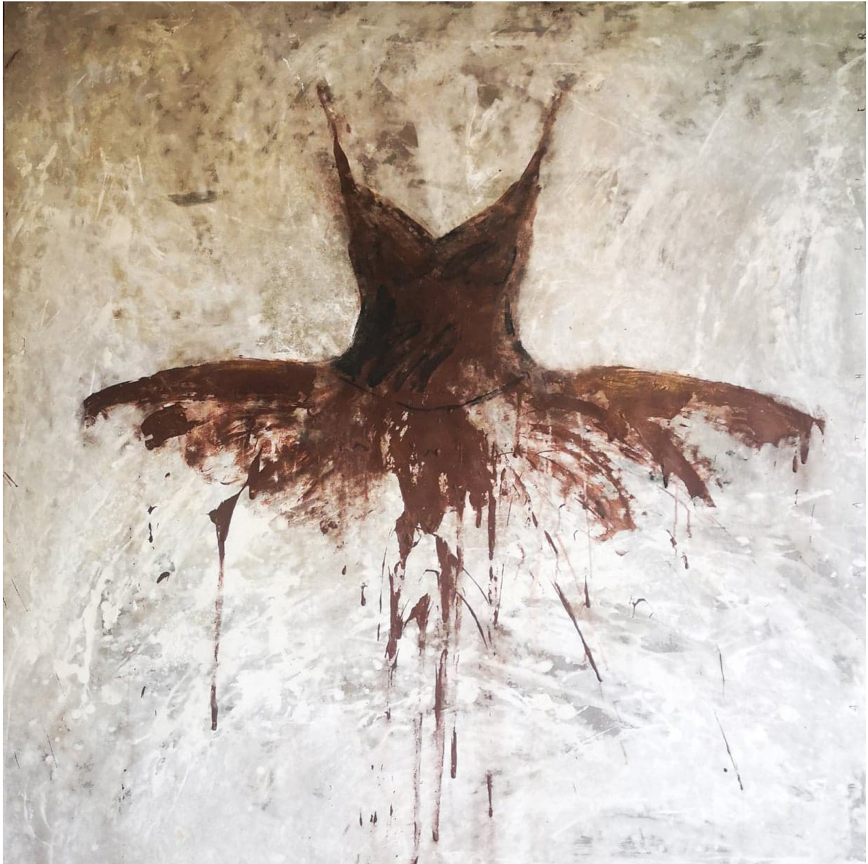
Ewa Bathelier Terra Tutu , 2020 Acrylic on cloth 63 x 63 in. Hand signed by artist $12,500