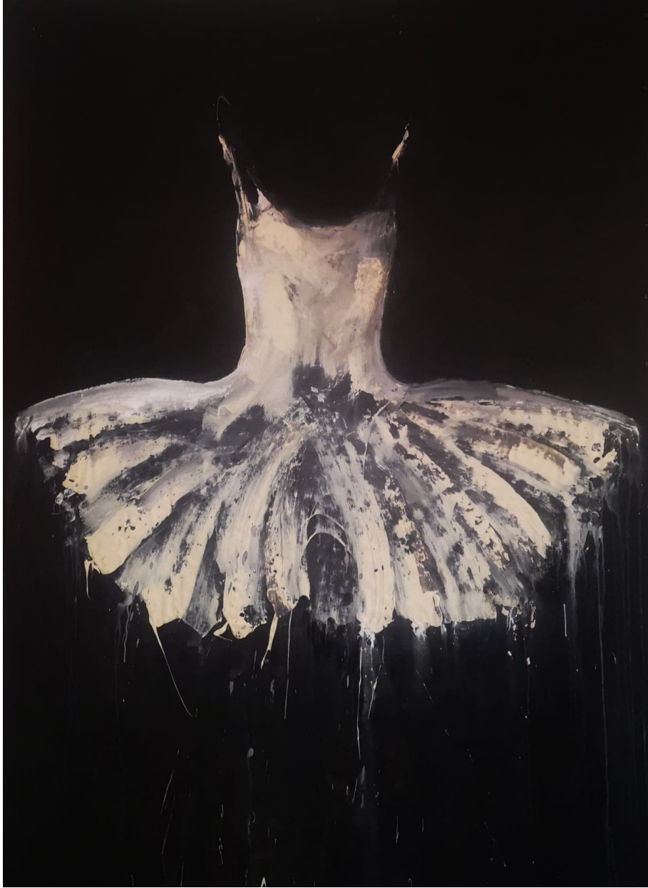
Ewa Bathelier Plumes , 2020 Acrylic on cloth 89 x 60 in. Hand signed by artist $15,000

747-A MIAMI CIRCLE NE, ATLANTA, GEORGIA 30324. (678) 705-4735