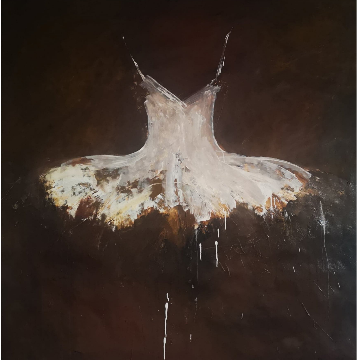
Ewa Bathelier Warm Velvet Tutu , 2020 Acrylic on cloth 63 x 63 in. Hand signed by artist $12,500