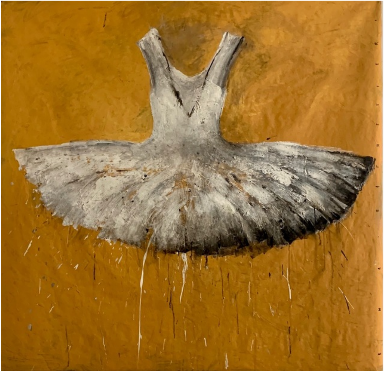
Ewa Bathelier Senape Dress , 2019 Acrylic on cloth 78.7 x 78.7 in. Hand signed by artist $15,000