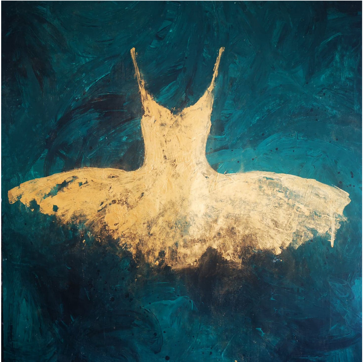
Ewa Bathelier Venice Dress 2 , 2020 Acrylic on cloth 78.74 x 78.74 in. Hand signed by artist